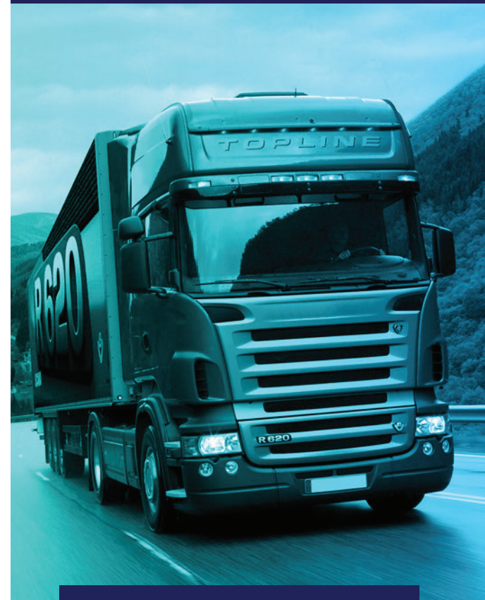
No scrap metal, trade plate or roadside recovery risks considered.